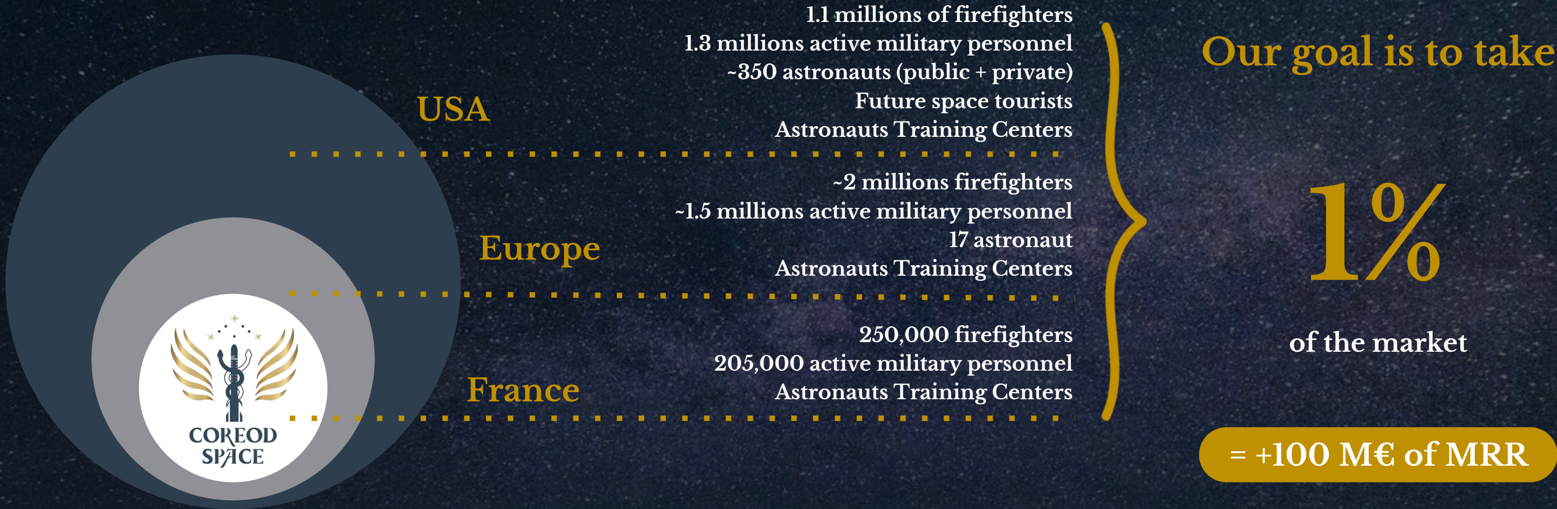
Examples of clients